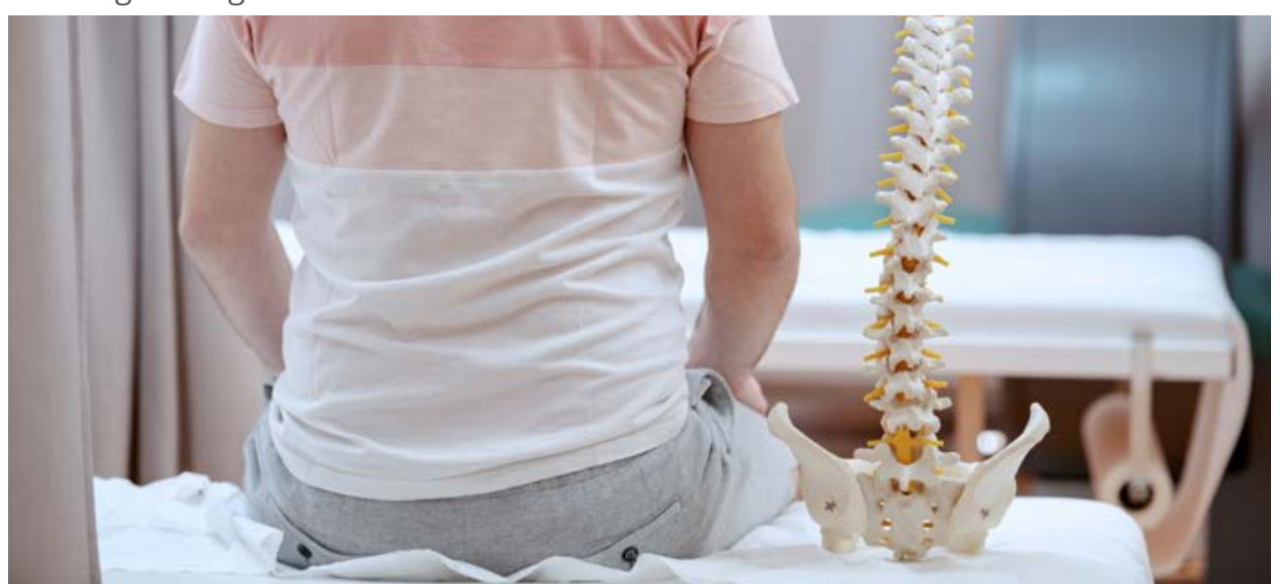
*Please note, for the purpose of this resource, the examples here focus on sitting posture. Other positions are, of course, of equal importance and depend upon a person's individual needs. For advice regarding difficulties you may be having concerning an individual's postural management, please refer to the Signposting Section in this booklet on page 36.